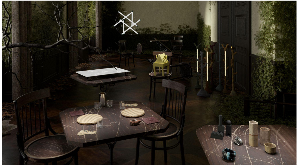
The Austrian Virtual Exhibition

The Austrian Collection London, UK London Design Festival 18-26 September 2021