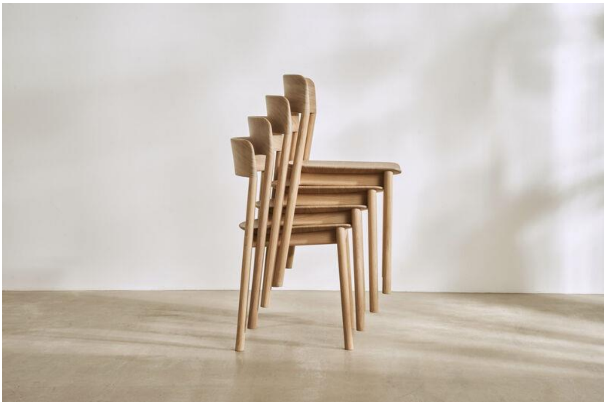
Ovo chairs by Fosters & Partners for Benchmark (pictured above)

A field-to-fork seasonal pop-up restaurant run by River Cottage will also sit alongside the Natural Living area.