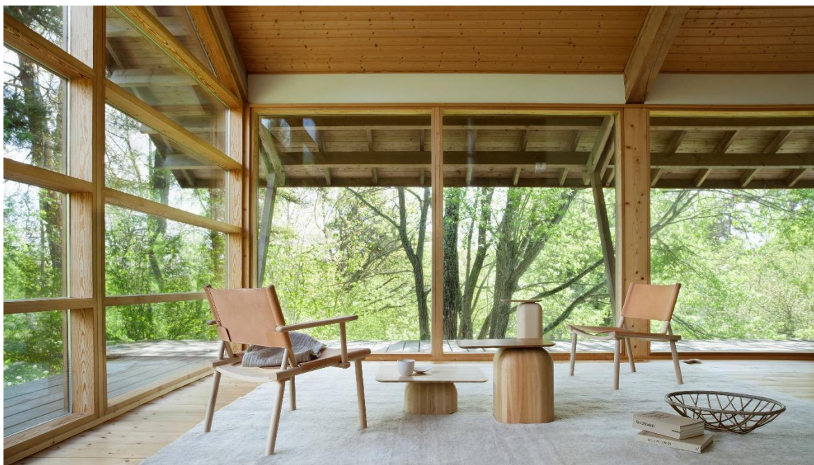
Nikari (pictured above)

As part of London Design Festival 2021, Planted will launch its flagship outdoor London show at one of the UK's most sustainable urban regeneration sites, King's Cross, with the stated aim of being the first zero-waste design event.