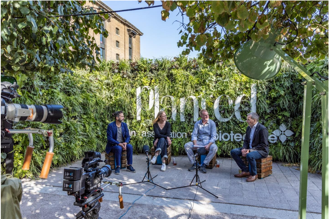
Planted Unearthed outdoor studio (pictured above)

“Partly as a result of the Covid 19 pandemic but also due to the accelerating and undeniable changes to our climate which we are now witness to, there is an urgent need for our society to unite around environmental issues in order to reverse the damaging effects of excessive consumption and restore the natural systems we have destroyed. Planted’s platform will enable those of us in the design industry and beyond, who understand the delicate balance we are putting at risk, to effect change and identify solutions to an enormous problem,” said Oliver Heath, Planted’s biophilic design advisor