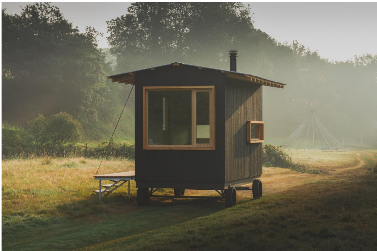
Nomad Cabin by Out of the Valley (pictured above)

“By working only with brands who place the environment, nature and truly sustainable practice at the heart of everything they do and ensuring every part of the show production is repurposed, reused or recycled can we help shift the dial towards more circular systems and achieving best practice. This is a huge challenge but we are excited, energised and focused on changing the way events are delivered.”